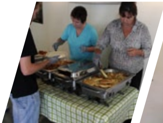
Beat The Streets Community Meal Program

Our vision is to be a church that never shuts; a church without walls. A church that has so many laneways into the community, its only limit is the imagination of the people inside the church. Everyone is a minister all the time. We exist so that everybody would come to know Christ, be transformed and grow as a disciple. We exist for our community by being real people, doing good, God's way.